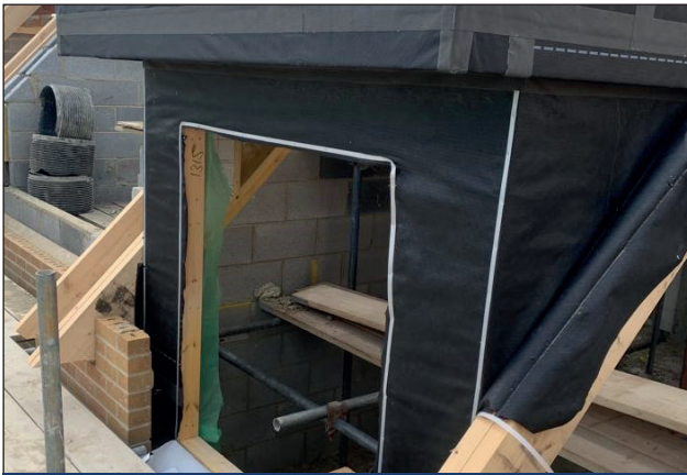
Fully Designed & Engineered

Dormers enhance a 'Room in Roof' design and create additional full height space – we offer a standard prefabricated or bespoke dormer solution to ensure quality, enhance speed of build and reduce working at height. An insulated dormer built offsite as part of your total roof solution from Wyckham Blackwell. All dormers are fully engineered to your design and supplied to site either as a 'kit' or 'complete' ready to install.