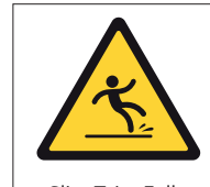
Slip, Trip, Falls