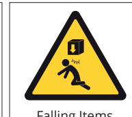
Falling Items from Above