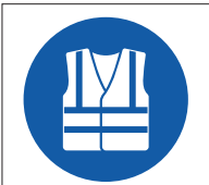
Hi Vis Wear