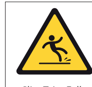
Slip, Trip, Falls