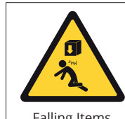
Falling Items from Above