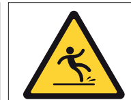
Slip, Trip, Falls