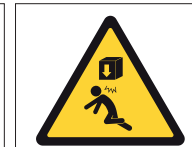
Falling Items from Above