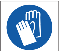
Hand Protection Gloves can be removed to untie/tie rope knots