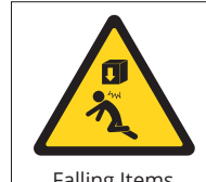
Falling Items from Above